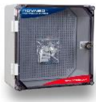
1. Enclosure IP65