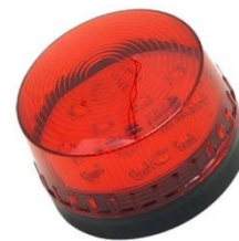
3. Siren Acoustics+LED