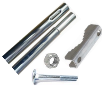
2. Mounting Kit